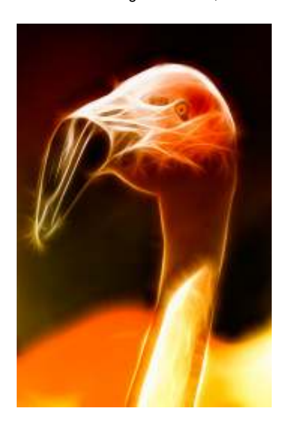
Photo of a flamingo at the zoo, which I Photoshopped. Is this general because its recognizable?