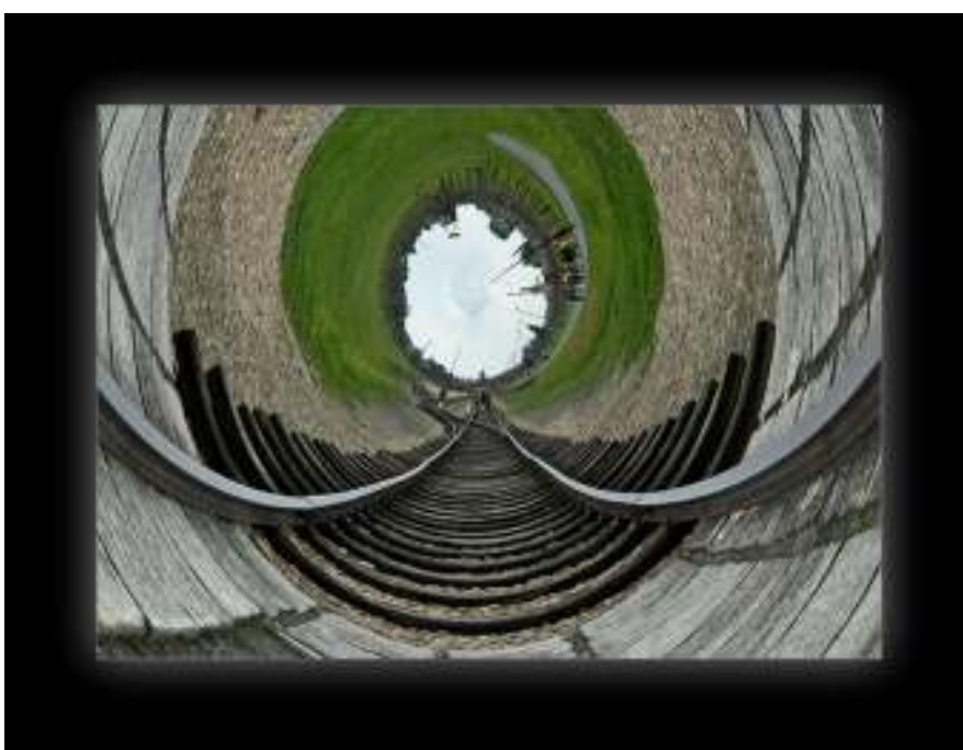
You will be gone for hours now. Have fun.