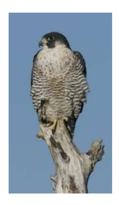
Adult Peregrine Falcon